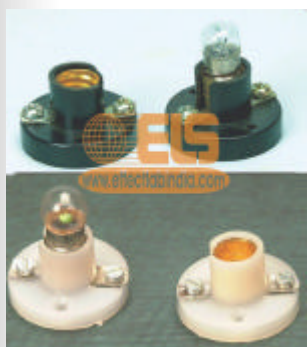
Lampholder M.E.S. (ELP.111.132)

To take flash lamp bulbs, rolled shell of plated brass mounted in molded plastic base with two screw connections.