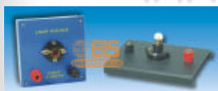
Lampholder M.E.S. mounted (ELP.111.133)

To take flash lamp bulbs, rolled shell of plated brass mounted in molded plastic base with two screw connections.