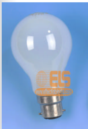
Lamp Low Voltage (ELP.111.130)