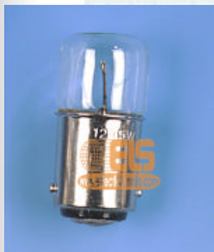
Lamps Low Voltage (ELP.111.131)

With straight axial filament, double contact, S.B.C.